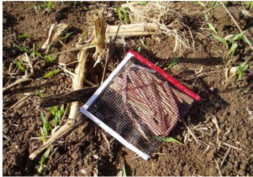
Figure 1. Litter bag filled with dried maize leaves.